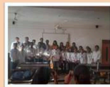
Technical Event Paper/Poster/ Quiz Competition held on 25-3-2023.