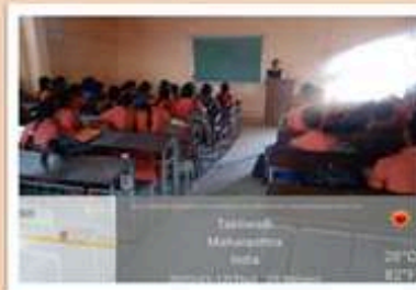
Career Guidance to 10 students.