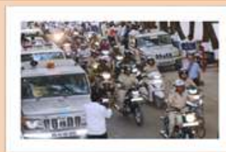
Arrangement of bike rally with (with the use of helmets) aware about use of helmets.