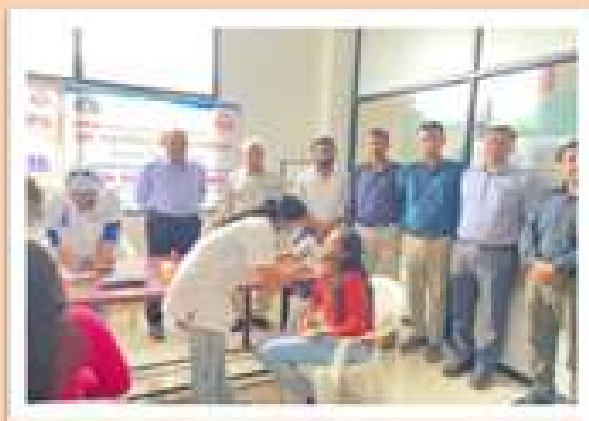
Dental checkup of Students on 21/09/2022