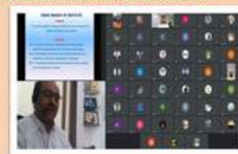
On line Alumni Meet Conducted on 7-4-23.